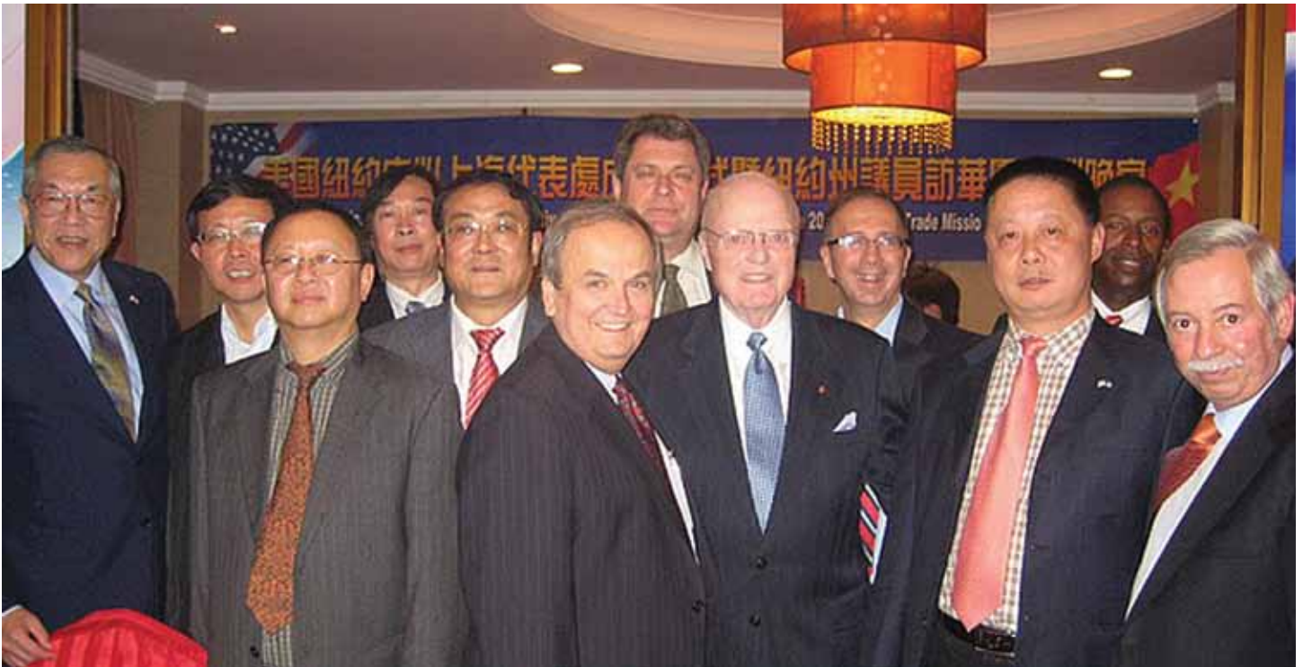
Trade mission delegation at the opening of New York in China Center's Shanghai office and farewell dinner.

AABDC and New York in China Center wish to acknowledge the following organizations and individuals for their assistance and support