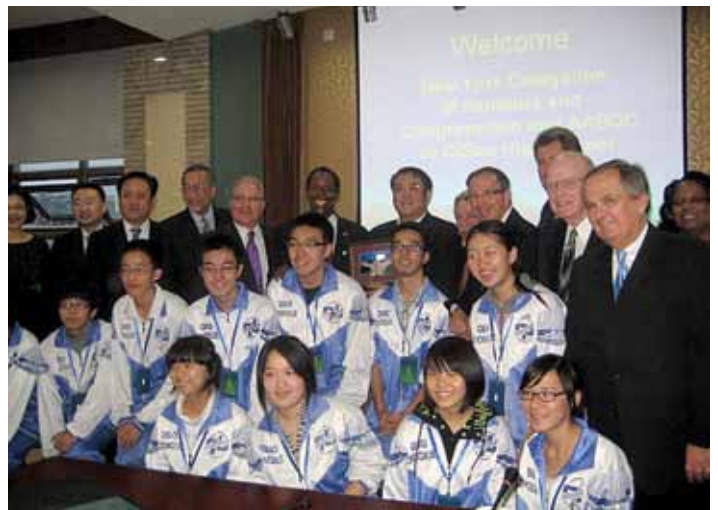
With students of Qi Bao High School in Shanghai.