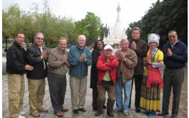
The delegation visited the Minority Village’s Buddhist temple in Kunming, Yunnan Province.