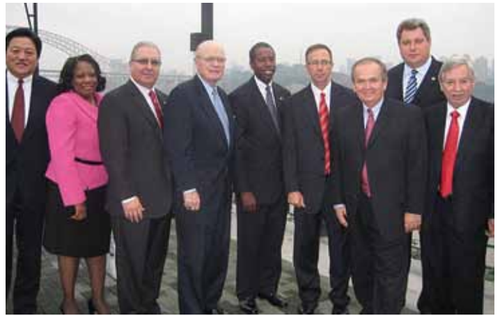
Members of the trade mission in the New York in China Center's Dalian office.